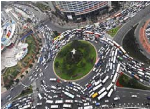
A 21st Century traffic jam in China... If all the cars were more fuel efficient would you feel better about this picture?

(But) are environmentalists really prepared to embrace a simpler, less materialistic life? Or do they still want all the stuff, but in a more efficient way?