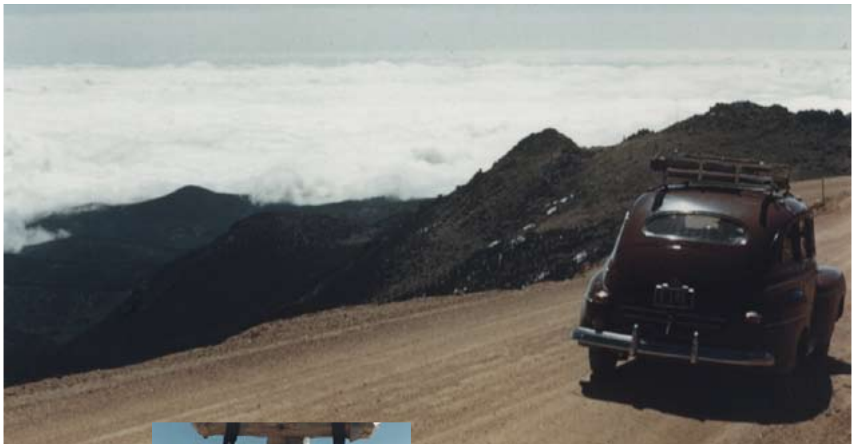
Taking the road to the top of Pike's Peak