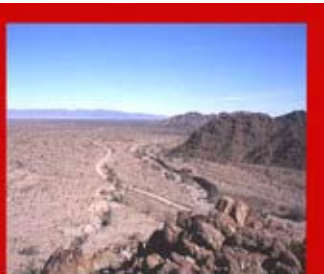
Basin & Range Watch