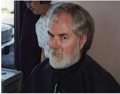
ROBERT FULGHUM: author of the best seller "Kindergarten" book, Fulghum did NOT like having his picture taken when he was getting a haircut.