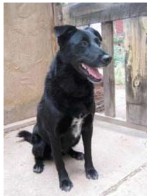
Luna 13962503 Female/Spayed Retriever, Labrador/Mix 7 years 4 months