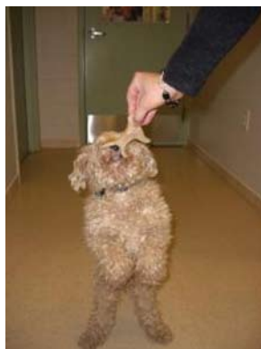
Sandy 14895457 Male/Neutered Poodle, Toy/Mix 10 years 1 month