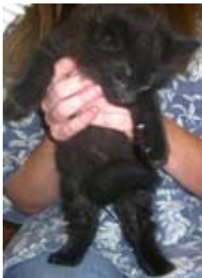
Pandora 13359114 Cat Female/Spayed Domestic Short- hair/Mix 9 months

...These wonderful animals are also standing by and ready to be adopted by a loving home.