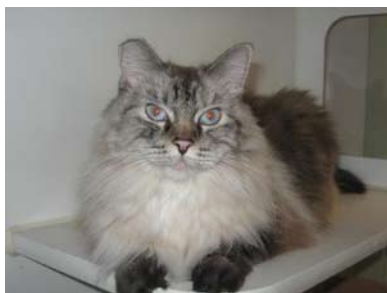
Miko 15068107 Female/Spayed Himalayan/Mix 2 years