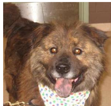
Brody 14555127 Male/Neutered Chow Chow/Mix 4 years 2 months