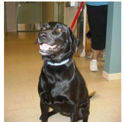
Jenna 14413885 Female Retriever, Labrador/Mix 3 years 2 months