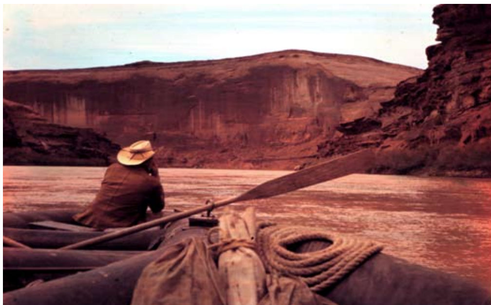
Approaching Tapestry Wall...at right, CAMP.