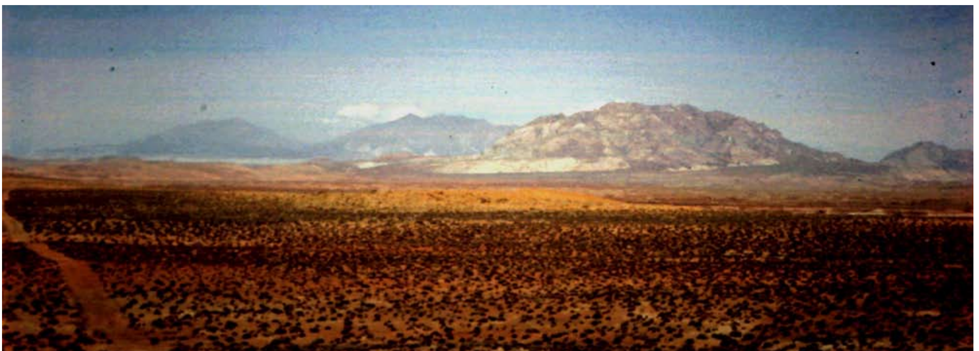
The Henry Mountains in the distance.

Took us 2 hrs 13 min. going, 2 hrs 12 min. return- ing. Had lunch there, recorded names. Stayed awhile.