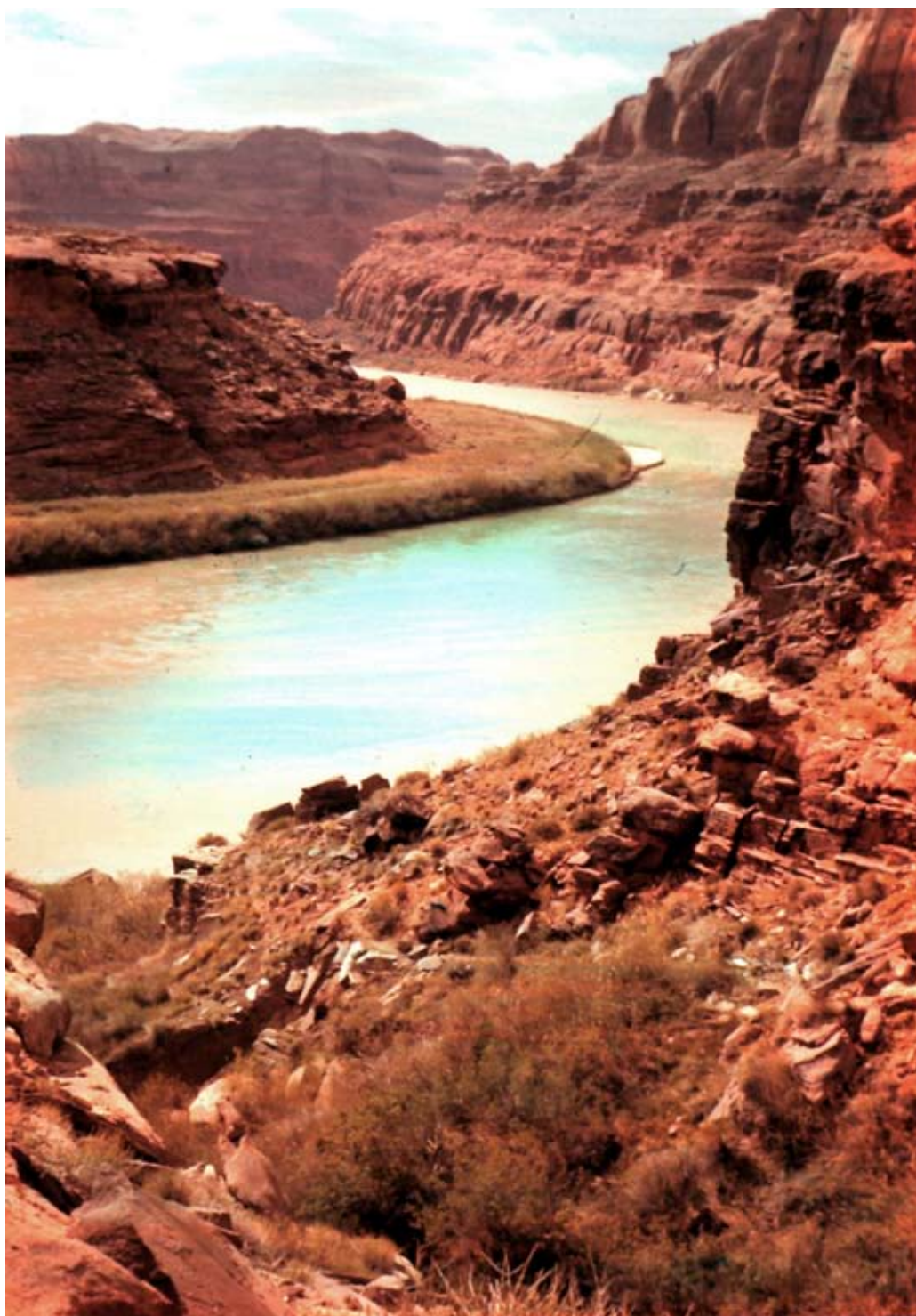
Approaching Hole in the Rock...