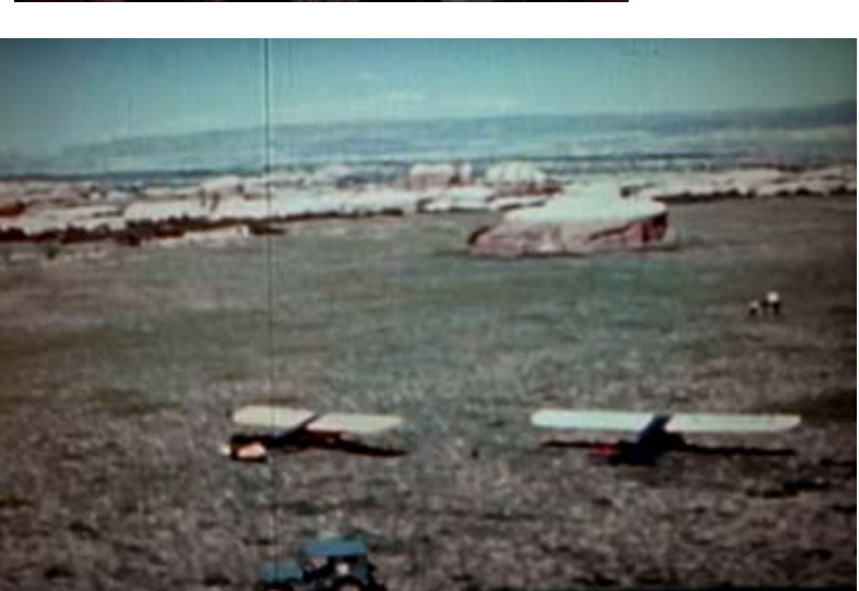
In 1949, it was possible to fly a small Cessna-type aircraft out of Chesler Park in the Needles Country southwest of Moab (later part of Canyonlands NP. here are still images from that scene in the film...