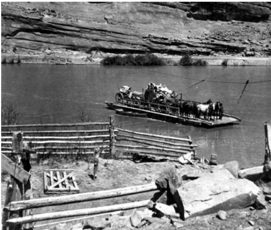
The original ferry, which crossed the river near today's bridge location.