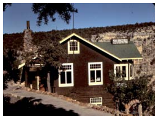
THE KOLB STUDIO, on the rim of the canyon, was owned and operated by Emery & Ellsworth Kolb, until Emery's death in the mid-70s.