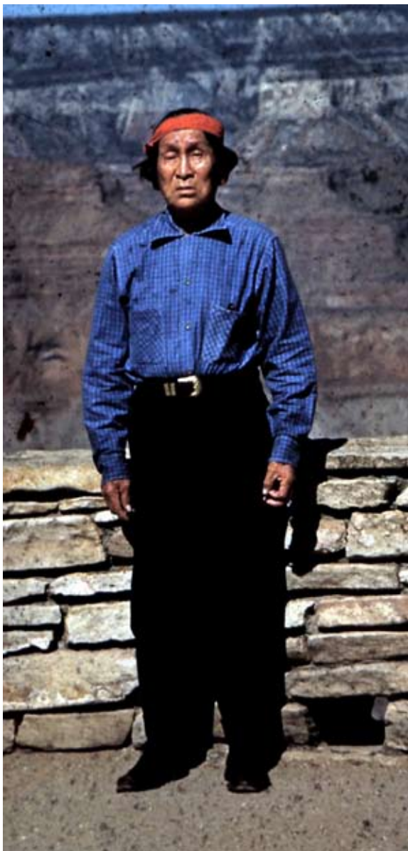
A Navajo man who worked for Fred Harvey Co. in the early 1950s.