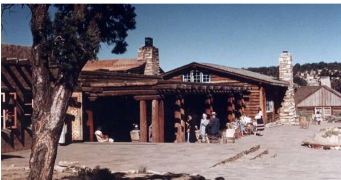
A busy summer day at the Bright Angel Lodge. 1950