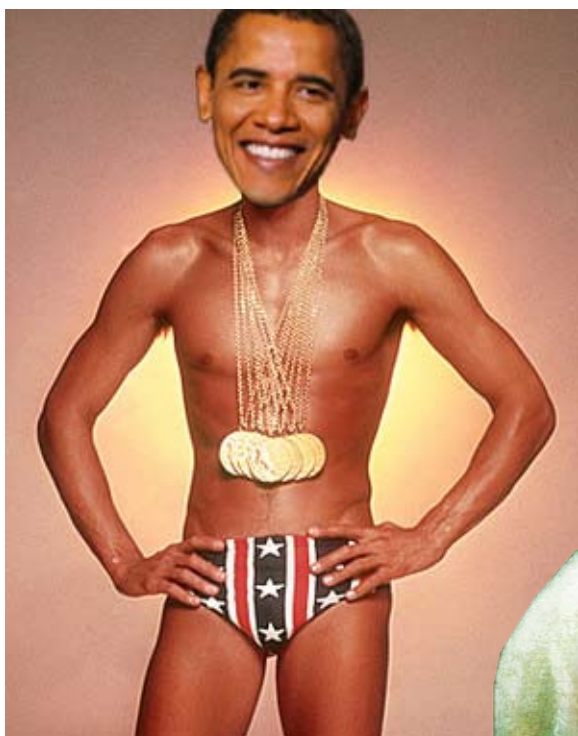
PRESIDENT OBAMA wears the 'Red, White & Blue!'