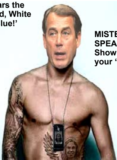
MISTER SPEAKER! Show us your 'toos!