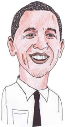
Come ON, PEOPLE! Let's keep the Z going!