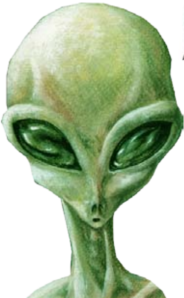
GO GREEN! JOIN THE BACKBONE!!!