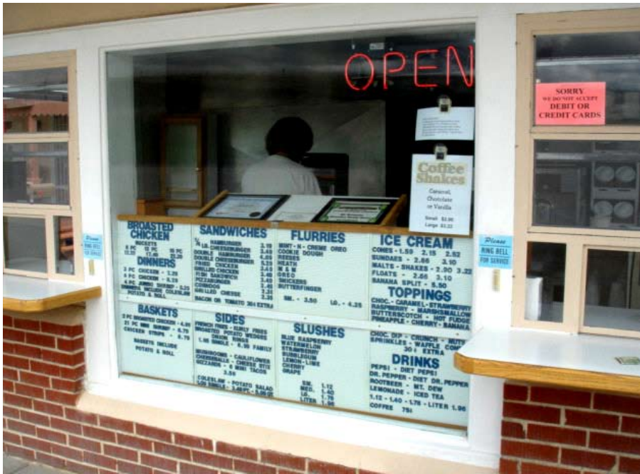
The Banana Split Portal...Crawford, Nebraska