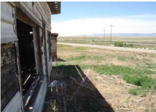
Ethel's Cafe'...Cisco, Utah

What do you see when you look out your window? Or into one?