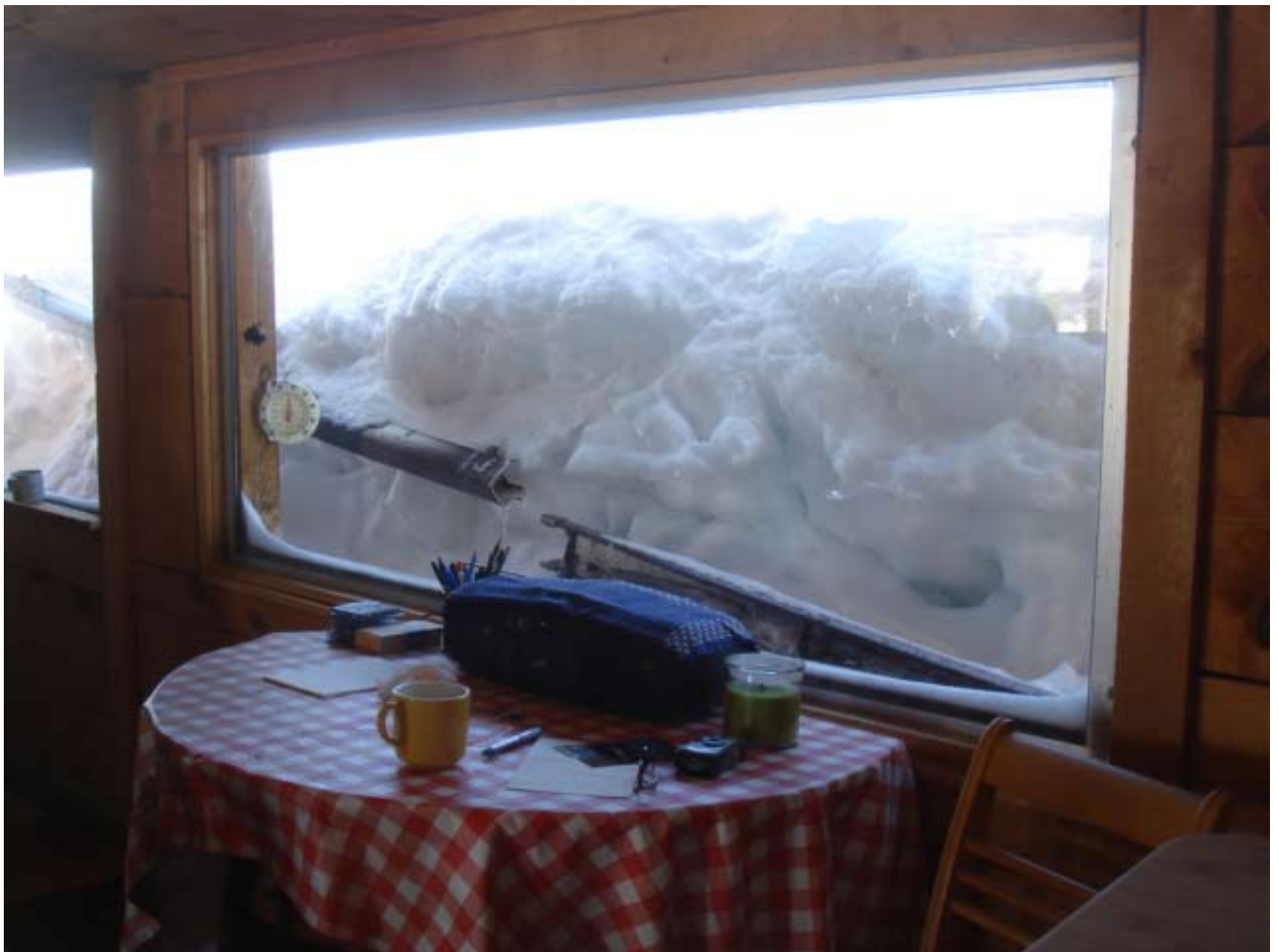
Too much snow. San Juan County. Winter 2009-2010