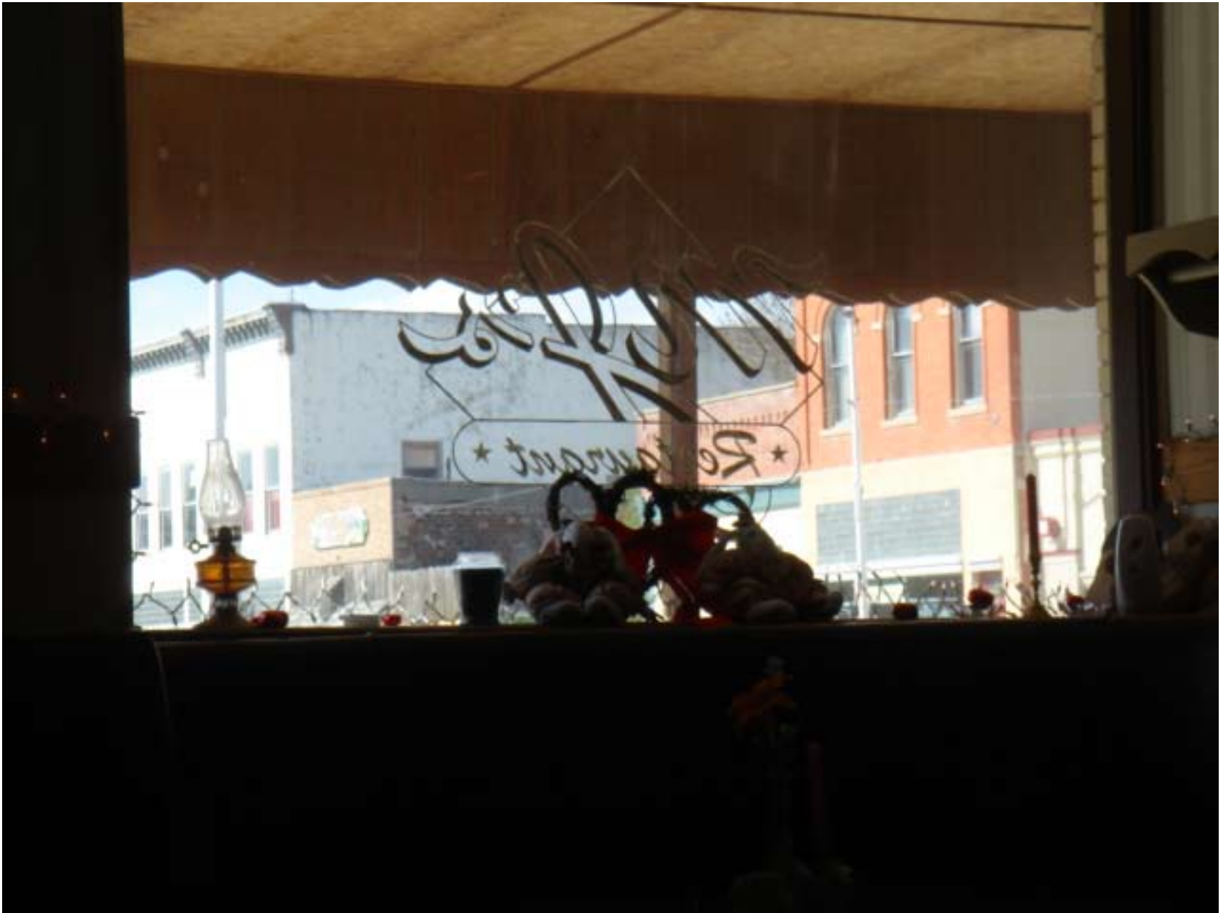
Frontier Cafe. Crawford, Nebraska