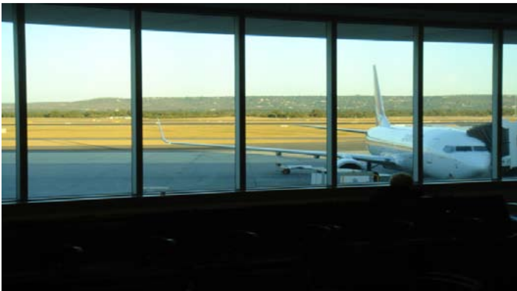
Qantas departure lounge. Perth Domestic Airport, Australia

What do you see when you look out your window? Or into one? Send us your window views and we'll post them in the Zephyr... cczephyr@gmail.com