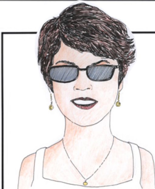
LIFETIME BACKBONE MEMBER