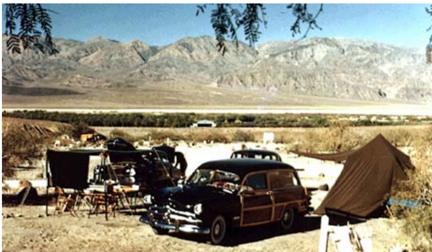
DEATH VALLEY, Texas Springs Campground.