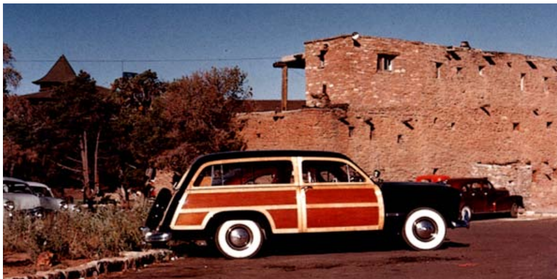
South Rim, Grand Canyon. 1952

I've put together a collection of that wonderful car, at various locations around the West from 1950 to 1953.