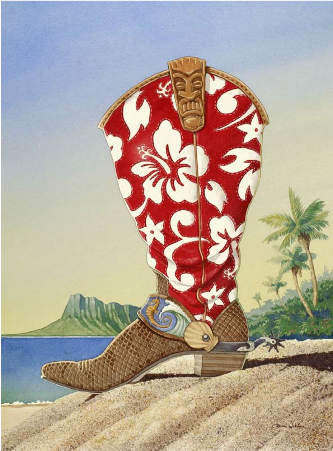
West of the Tropics...

Funny how we humans all crave paradise. I'm not talking about any hypothetical paradise beyond the grave either; that always just sounded like a bore to me. No, I'm talking about real, flower scented, bare breasted, warm and sandy, sin-filled, earthly paradise.