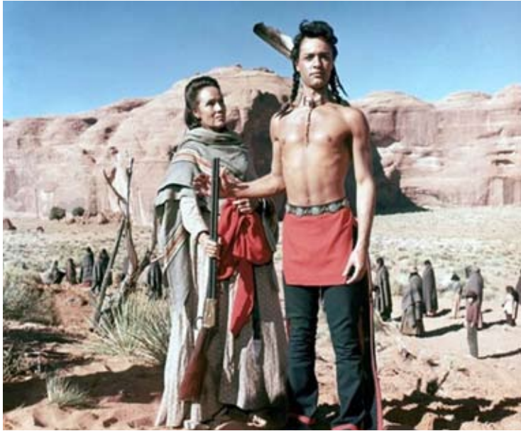
Dolores del Rio & Sal Mineo

and Ford was not getting the performance that he wanted from one of his stars. It was the climactic scene of the movie---Ricardo Montalban and Sal Mineo fight to the death for a woman they both love and when the smoke clears, Mineo lies dead. Dolores Del Rio, portraying Mineo's mother, falls to her knees and is supposed to weep uncontrollably for her fallen son. But for the camera, the tears would just not flow the way Ford expected them to. Take after take was shot, but Ford was dissatisfied with each one. He was determined to get it right, even if he had to stay there all day.